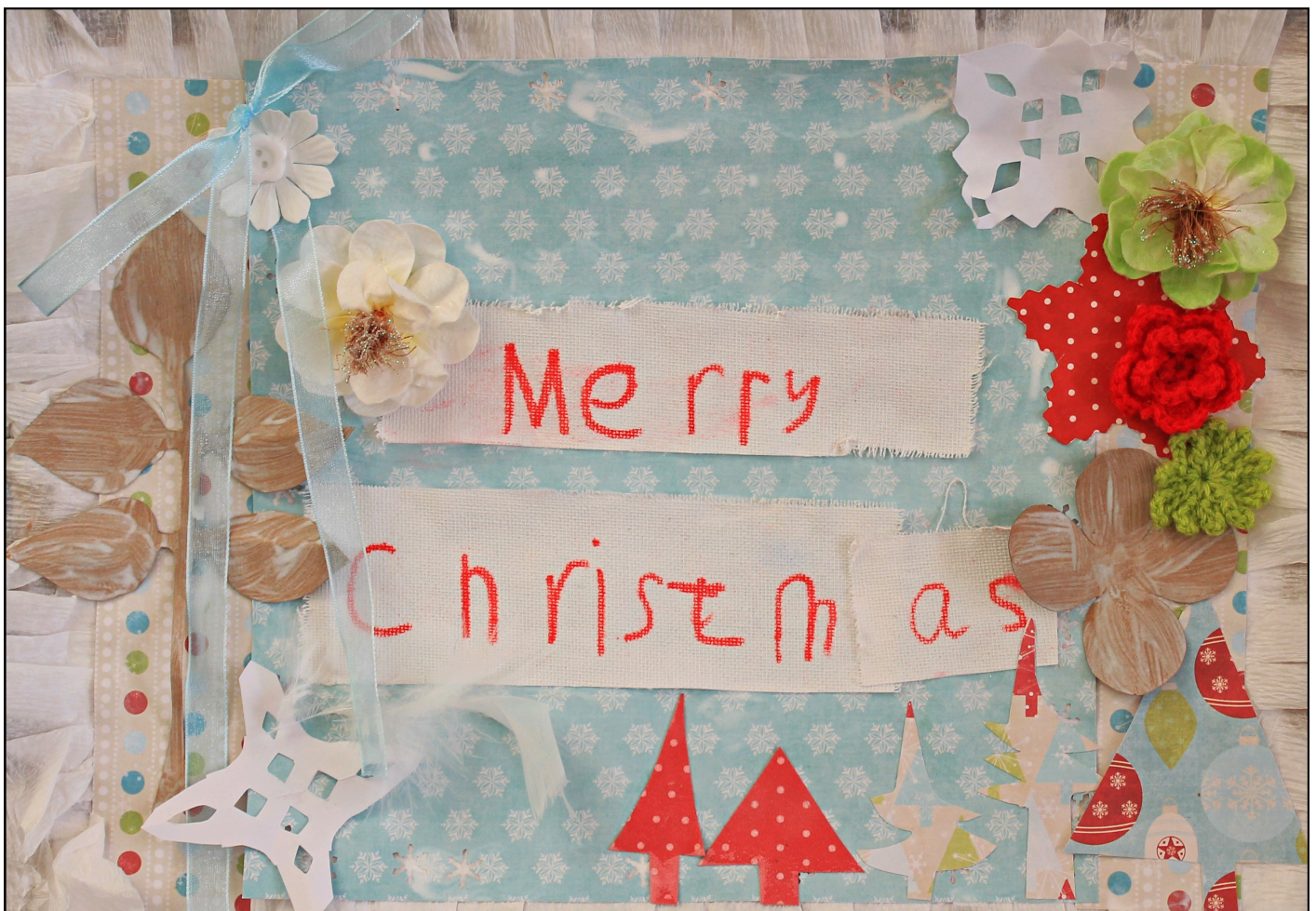
By Anna Korobczuk, Y1

We have been informed of vacancies with Eats, the school catering arm of Suffolk County Council. Eats provide meals for most Suffolk schools and are looking for cooks and catering assistants. If you are interested in possible vacancies, full details, including hours and rates of pay are available from school office.